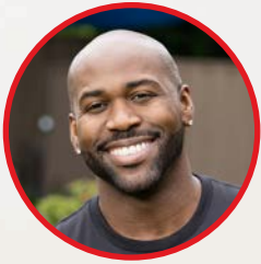
Dolvett Quince CELEBRITY TRAINER